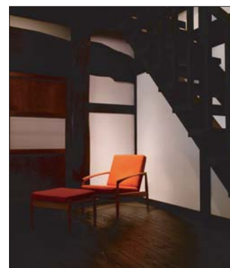
Paper Knife Sofa design Kai Kristiansen